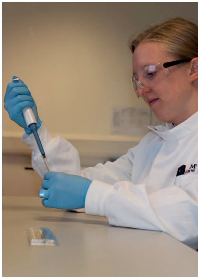
Staff prepare samples for testing

"We are unique in our EM in that all our staff have worked in cleanrooms and