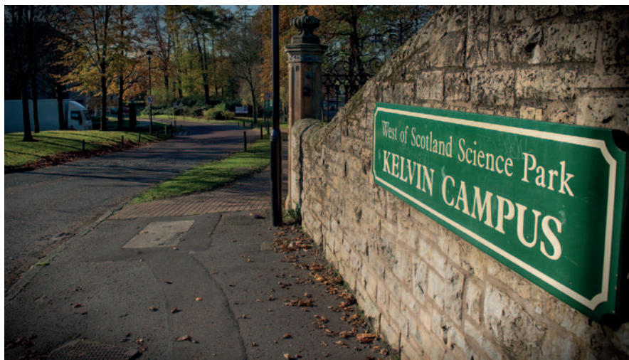
Cleanroom Zone and Assured Micro are based at the West of Scotland Science Park in Glasgow

During Cleanroom Zone's early development it became increasingly evident that customers also needed Environmental Monitoring (EM) in place